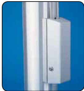
With Cylinder Lock