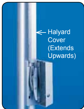
← Halyard Cover (Extends Upwards)